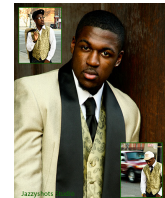
Image Inserts (one or more additional images in-set with another image)

$5 per each additional image: maximum of four. Size of inserts up to 2 x 3".